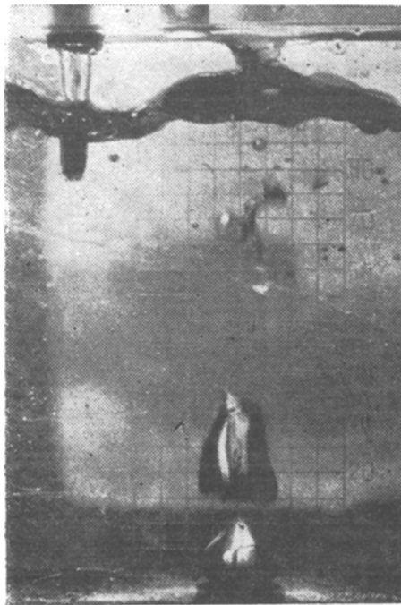
Fig. 1. Photograph of the separation of a vapor bubble in an underheated liquid; d_c = 0.003 m, h = 0.09 m, w_c = 40 m/sec, \Delta T = 11.5^\circ\text{K} .